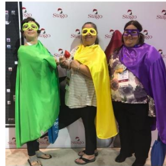
Lab Heroes Stago Transform Lab Care